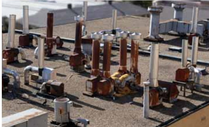
The SAAF™ PORTA-Scrubber can be used to capture fugitive emissions from laboratory vent hoods or chemical storage tanks.

The PORTA-Scrubber can be effectively used in a variety of fugitive emission applications, including sewage pumping station odor control or headworks, laboratory vent hood scrubbing, and at breather exhausts of chemical storage tanks. The PORTA-Scrubber is designed to induce a positive or negative pressure, depending on the application, on any enclosed space or vent.