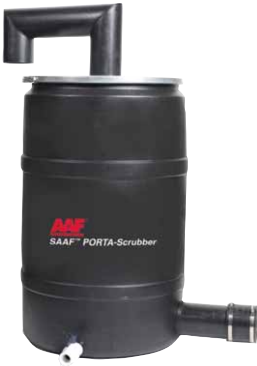
SAAF™ PORTA-Scrubber 200NP