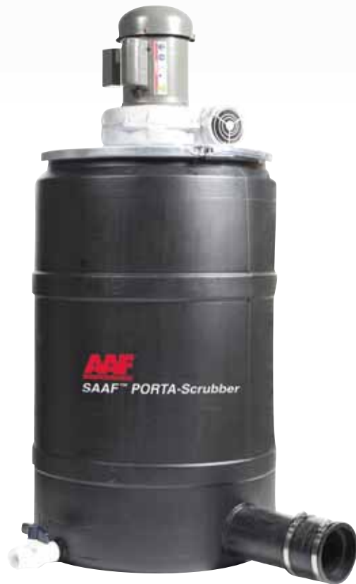
SAAF™ PORTA-Scrubber 200